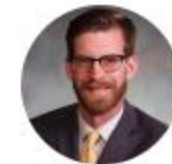
Senator Nick Hinrichsen