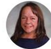
Senator Faith Winter