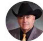
Senator Cleave Simpson