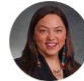
Senator Julie Gonzales