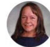
Senator Faith Winter