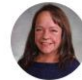
Senator Faith Winter