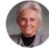
Senator Joann Ginal