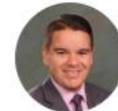
Senator Dominick Moreno