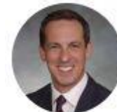
Senator Stephen Fenberg

Intellectual & Developmental Disabilities Awareness Day