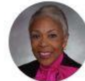
Senator Janet Buckner