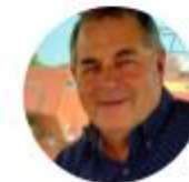
Senator Cleave Simpson

Intellectual & Developmental Disabilities Awareness Day