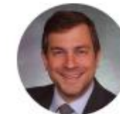
Senator Jeff Bridges