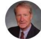
Senator Pete Lee